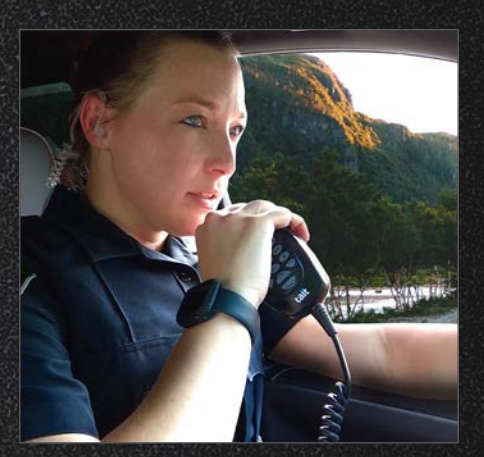
First responders can communicate with support staff equipped with smartphones.