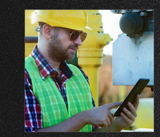
Field technicians can provide local context to remote engineers using video streaming.